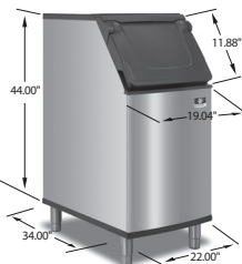
D420 310 lbs. (141 kgs) (Available January)