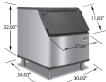
D400 290 lbs. (132 kgs) (Available January)