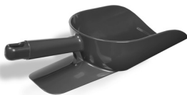
Ergonomic NSF approved sanitary ice scoop included