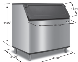
D970 710 lbs. (323 kgs)