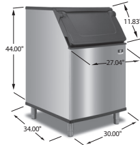
D570 430 lbs. (195 kgs) (Available January)